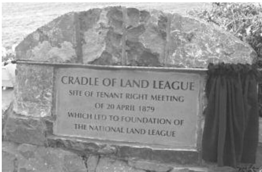
The plaque adorns the place where the first meeting took place.

Our country has seen many changes in recent times. Let us not forget that in the not too distant past things were much different. Michael Davitt and others invested their lives in advocating social injustice. As we now reap the benefits of that investment let me be mindful of those who pioneered the way.