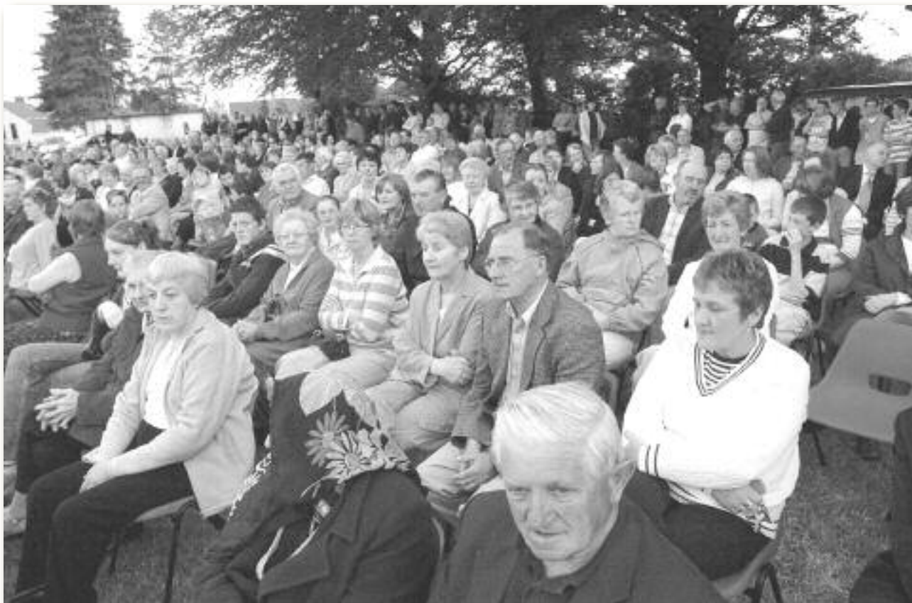
A selection of the crowd in attendance in Irishtown

By now darkness was falling and as traditional music, from a wonderful group of young musicians, filled the air, the atmosphere in Irishtown was really building, with the crowd gearing up towards the keenly anticipated outdoor night pageant. This historical show which depicted the life and times of Michael Davitt, his association with Irishtown and their combined contribution to the Land League was an unprecedented success and went down a treat with one and all.